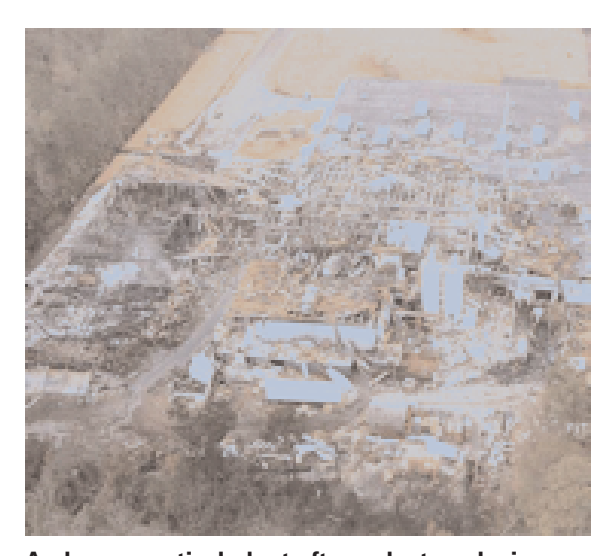
A pharmaceutical plant after a dust explosion.